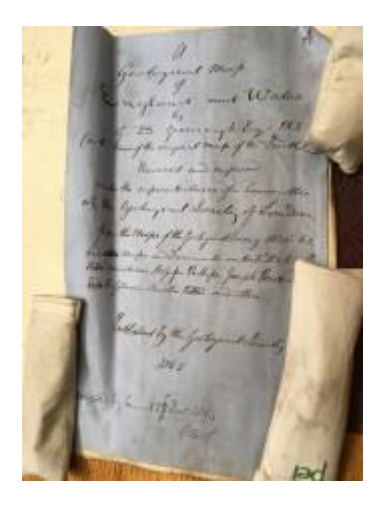
View more images

Find out more about Inter-Library Loans Contact us Back to top